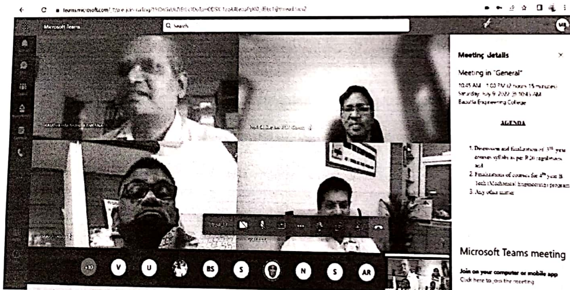
External Members with BOS Chairman.